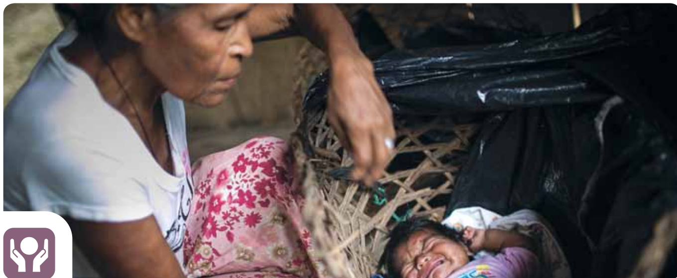
Jonas Ujresch/HelpAge International