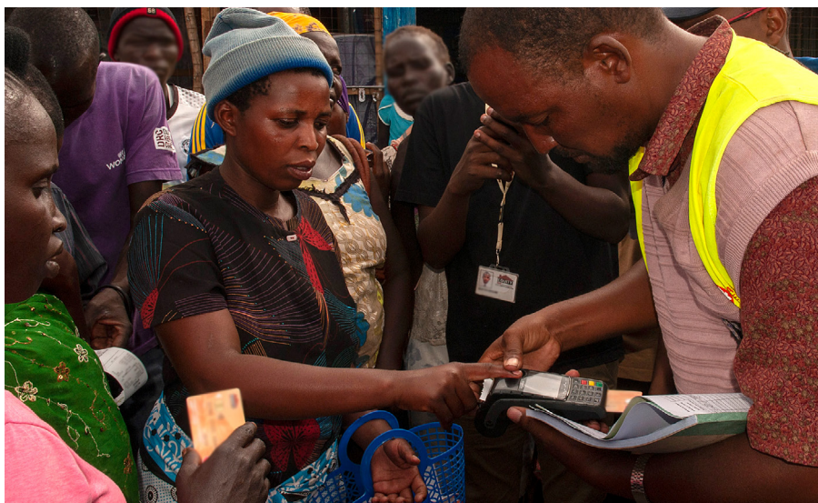
The distribution of cash-based assistance is verified using biometric data.

unintended outcomes. This issue has important implications for WFP's efforts to meet the basic food and nutritional needs of refugees and displaced populations, while also enhancing their self-reliance. In pursuit of these objectives, should WFP promote restricted cash transfers or vouchers that can only be spent on food? Or should WFP provide unrestricted cash and let recipients decide what is best for themselves? There is a need to address these questions: given the extreme vulnerability of humanitarian beneficiaries, even small differences in impact can make a huge difference in welfare outcomes. Humanitarian organisations also need to use their limited resources as effectively as possible to maximise their impact. Put simply, the specific modality of cash assistance matters.