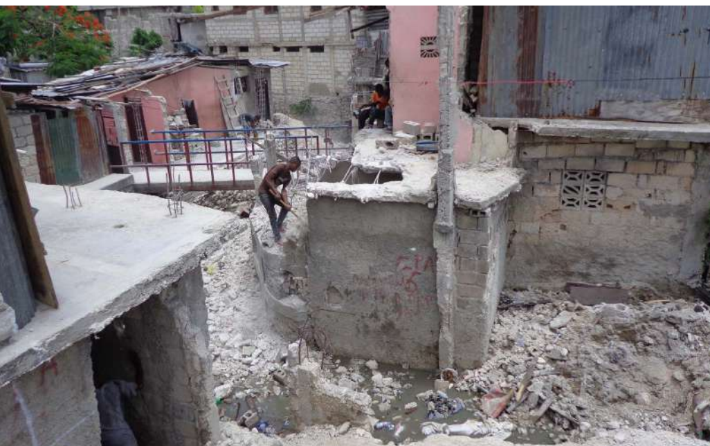
> Demolition of houses encroaching upon the rights-of-way to clear in order to carry out the security and development works for the ravine, June 2015