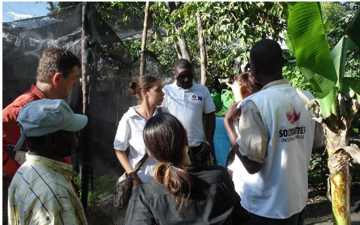
> Discussions between the WaSH team, the CA team and residents, November 2013