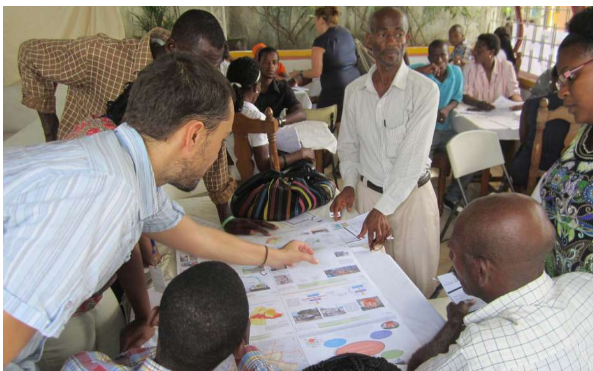
> Workshop to prepare the urban study, August 2013

“ The key to urban planning is the development of an urban expertise in the neighbourhood. »