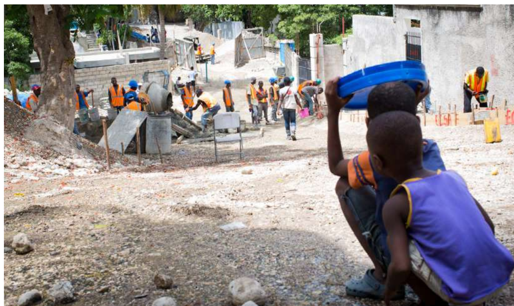
> Rehabilitation of the road in Bas Norguès, in collaboration with the MTPTC, 2014