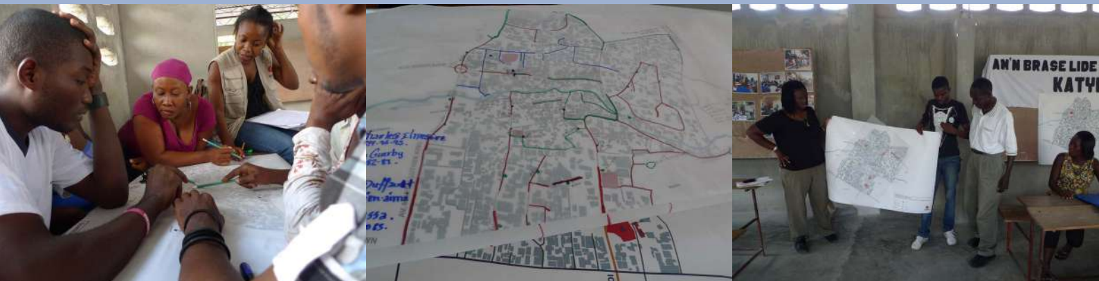
> Participatory workshops for the elaboration of the Christ Roi development plan, April - July 2013