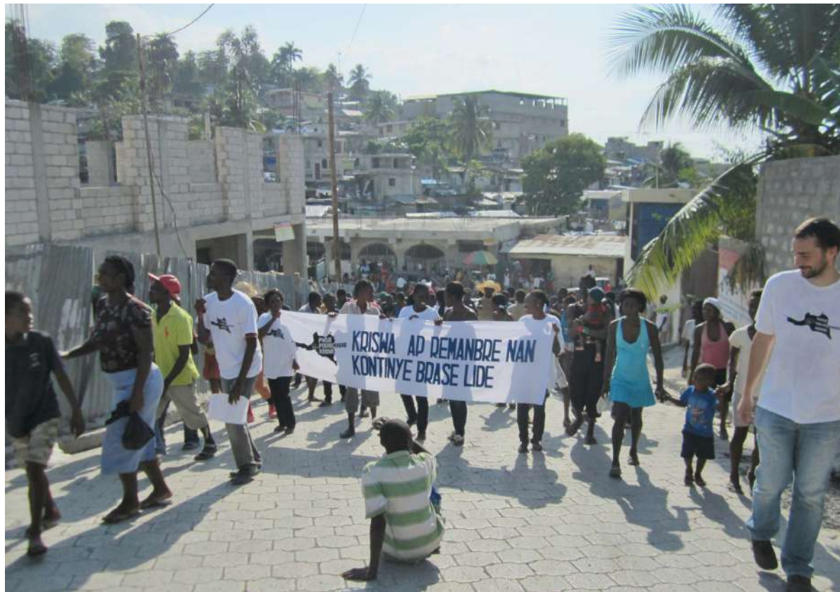
> Launching ceremony of the PARAQ project in Christ Roi, March 2013