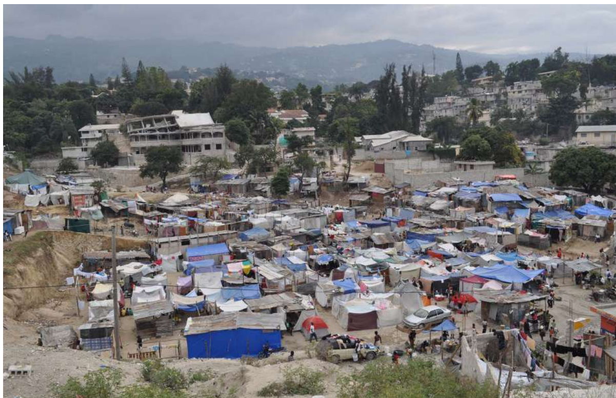
> IDP camp following the earthquake, Bristout-Bobin districts, January 2010

1. As many of the homes were destroyed or damaged by the earthquake, their inhabitants took refuge in tents in small informal camps or in the streets of their districts, or in larger, more formal camps outside the neighbourhood where NGOs concentrated their activities.