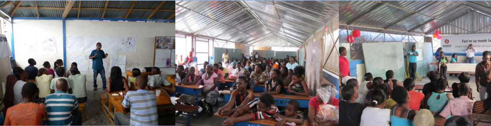
> De gauche à droite : ateliers participatif pour l'élaboration du schéma d'aménagement ; réunion mensuelle avec les habitants ; séance de sensibilisation sur le droits des femmes à l'occasion de la journée de la femme

• The communication aspect remains central throughout the whole intervention. It is an important point at the beginning of a project, when it must be clarified that such a project is going to support the project owner, and is not an emergency project. The inhabitants did not fall into the suspicion or skepticism that is regularly found in humanitarian projects in Haiti because the messages disseminated were transparent but thoughtful. The CA team conciliated, explained and brought the residents to reason in order to avoid community disputes 29 .