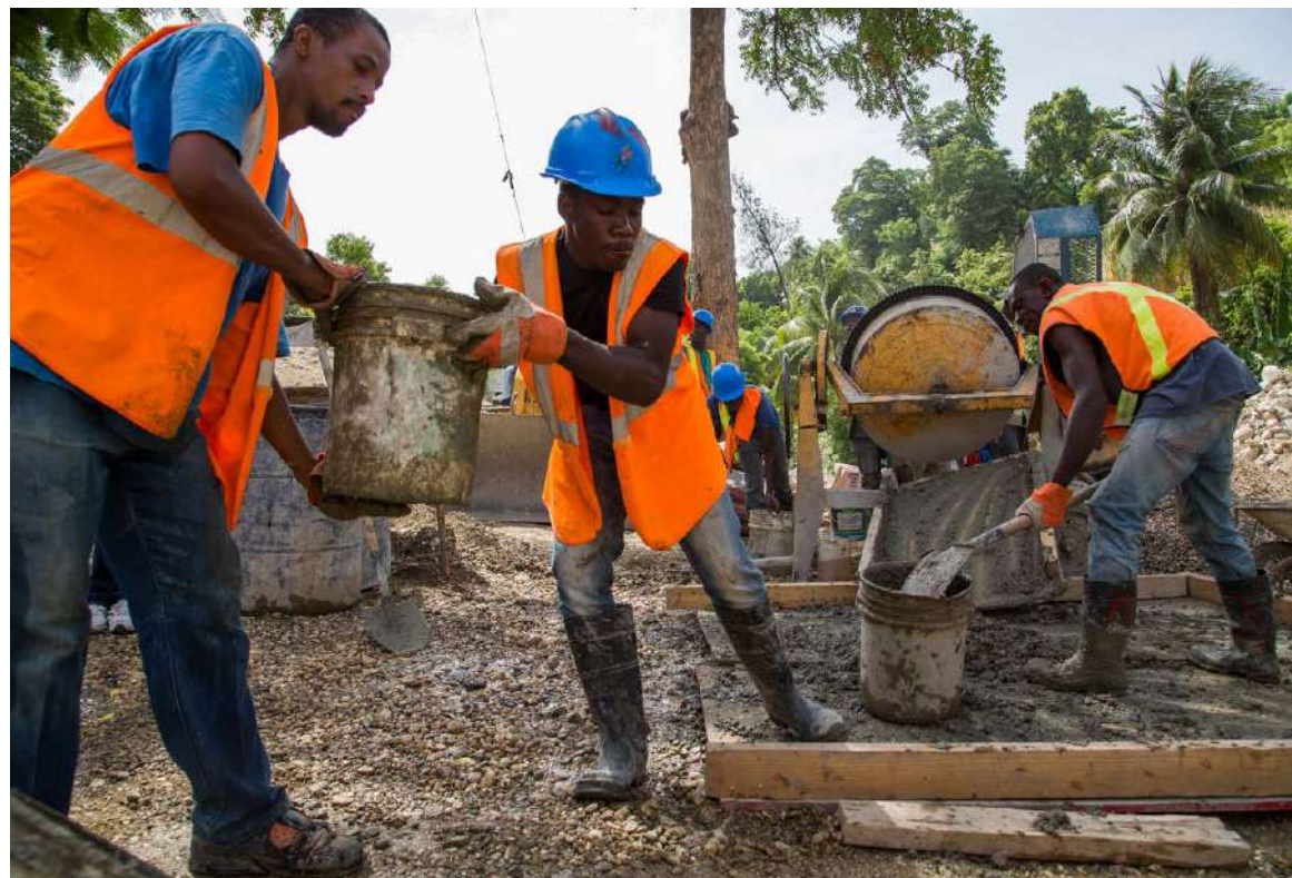
> Rehabilitation of the road in Bas Norguès, in collaboration with the MTPTC, 2014